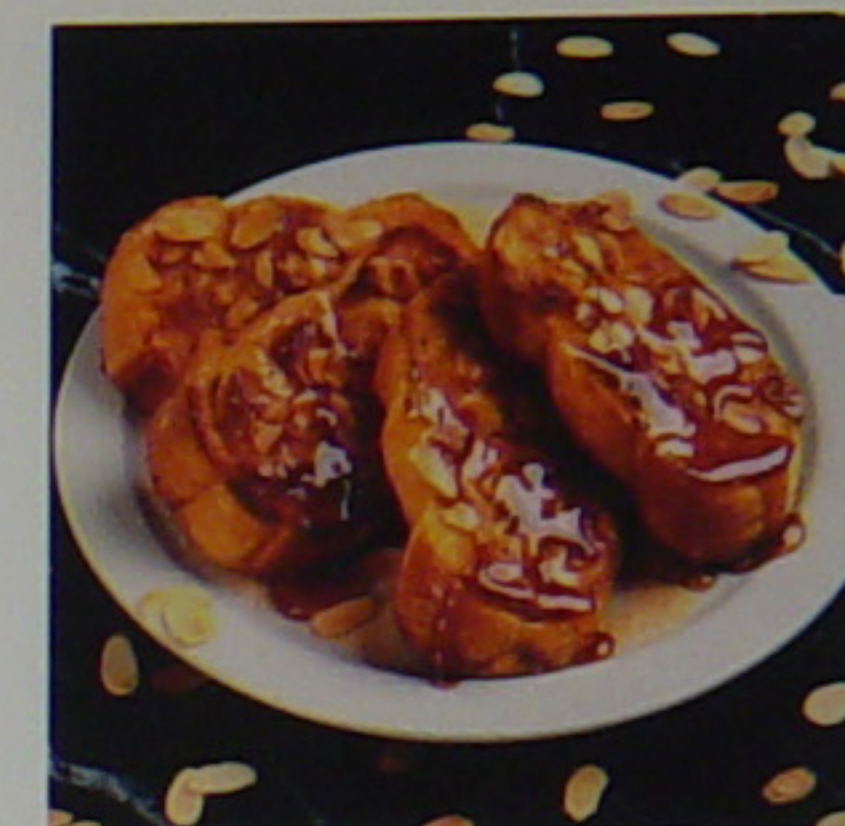
Cinnamon Nut French Toast

CINNAMON NUT FRENCH TOAST: Our Famous French Toast lightly coated with cinnamon and sliced almonds, dusted with cinnamon sugar. Served with our delicious apple syrup . . . . . $6.29