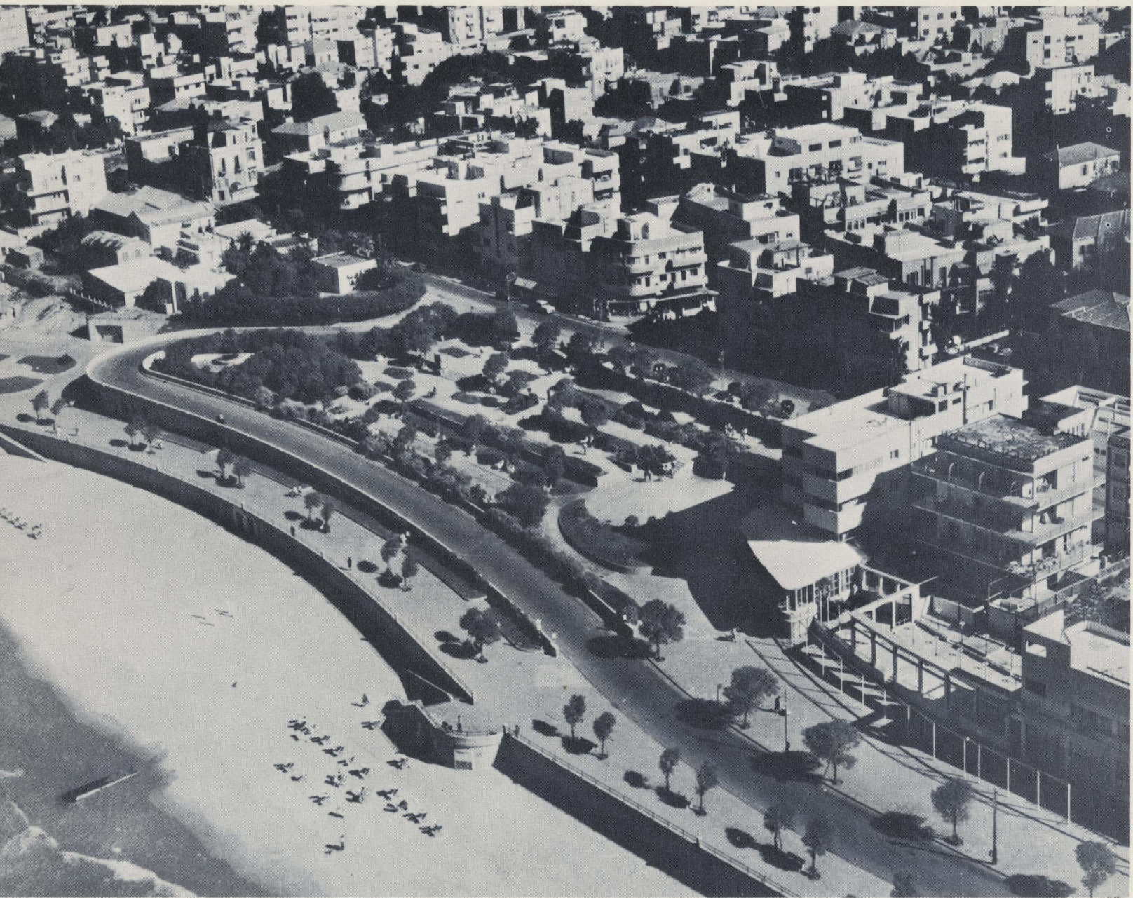
ESPLANADE, TEL AVIV