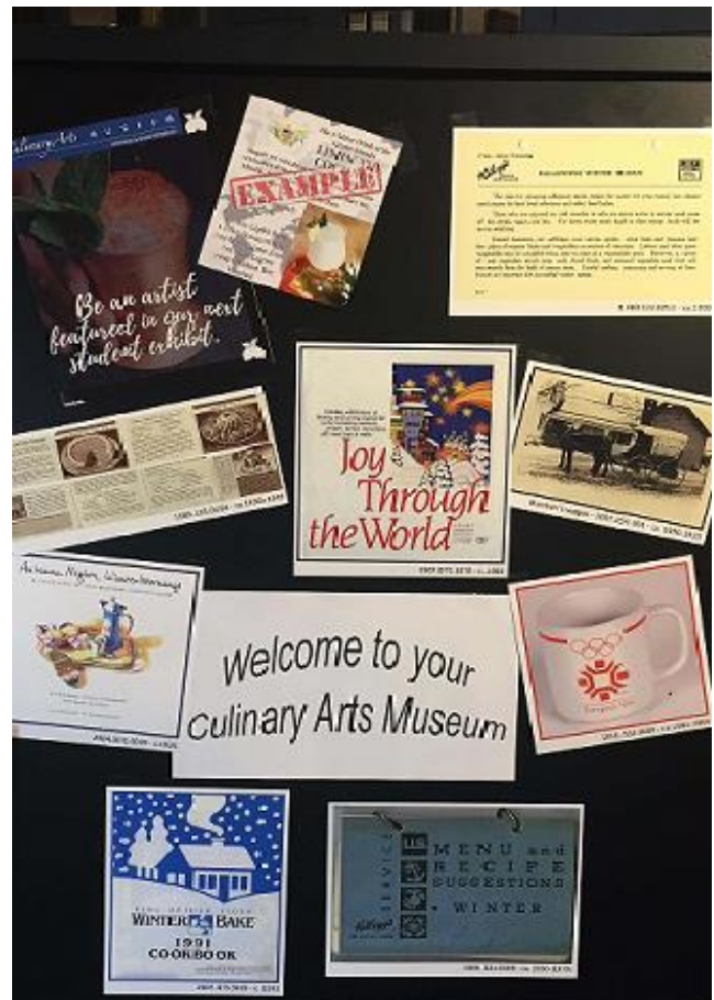
From the Culinary Arts Museum antiquarian cookbooks display

The Museum also continues to share its space with departments that need a special venue for onetime events (reserved through a system known as R25.) And it has become a regular meeting place for ongoing weekly BRIDGE →