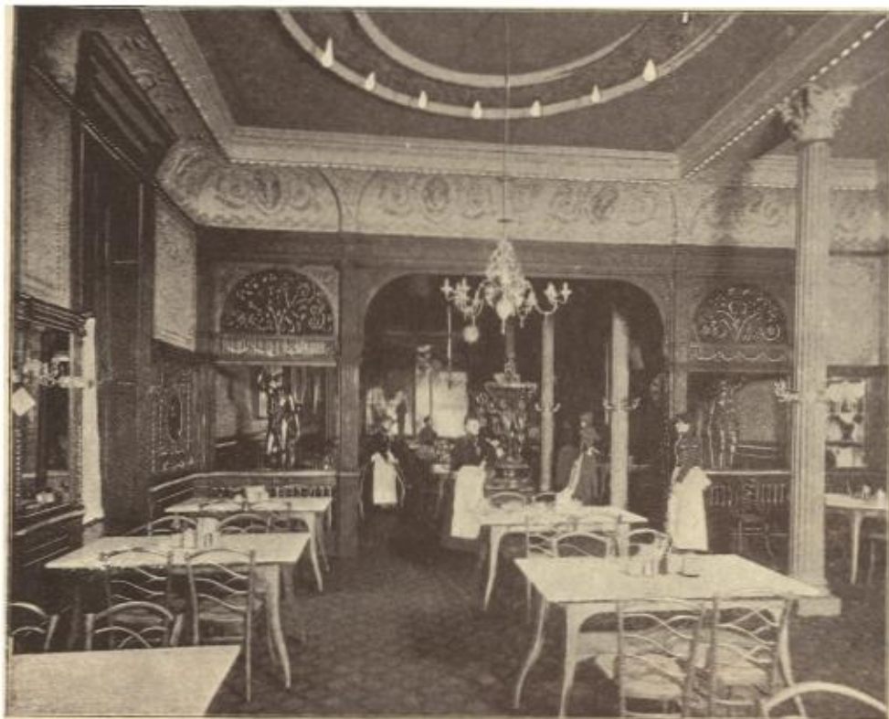
VIEW OF SMOKING ROOM.