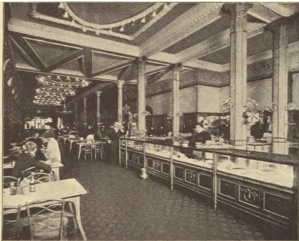
GENERAL VIEW OF RESTAURANT.