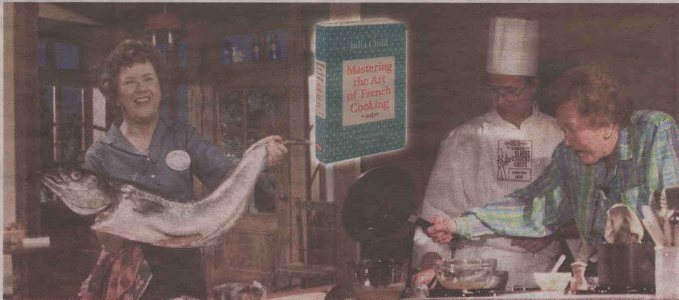
Julia Child working in the kitchen, from start to finish, entertaining and teaching!

Shortly after being fired from her job for "gross insubordination," Julia moved to Washington D.C. in 1941, at the beginning of World War II. In D.C. she volunteered as a research assistant for the Office of Strategic Services (OSS). It was while working for the OSS where Julia met her husband Paul Child. At the end of World War II, in September 1946, the two were married. Paul's job was reassigned to the American Embassy