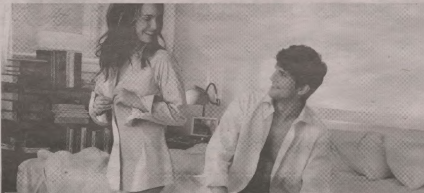
No strings attached cast exemplifying the awkwardness of being FWB.