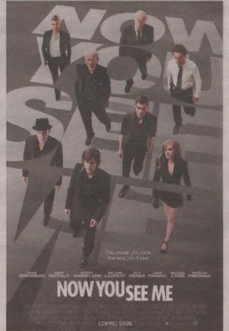
Now You See Me Movie Poster.

There is no doubt the movie's basic plot borrows heavily from the Ocean's franchise; yet, even with less star power, the movie still