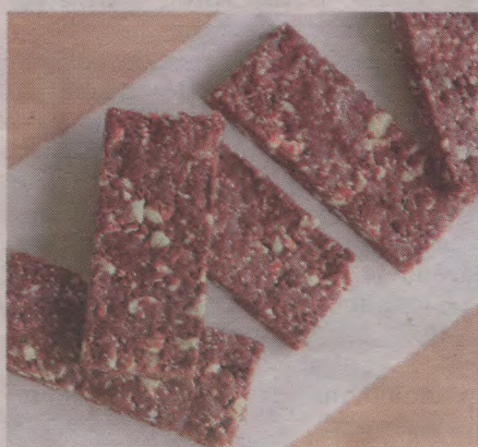
Homemade protein bars.