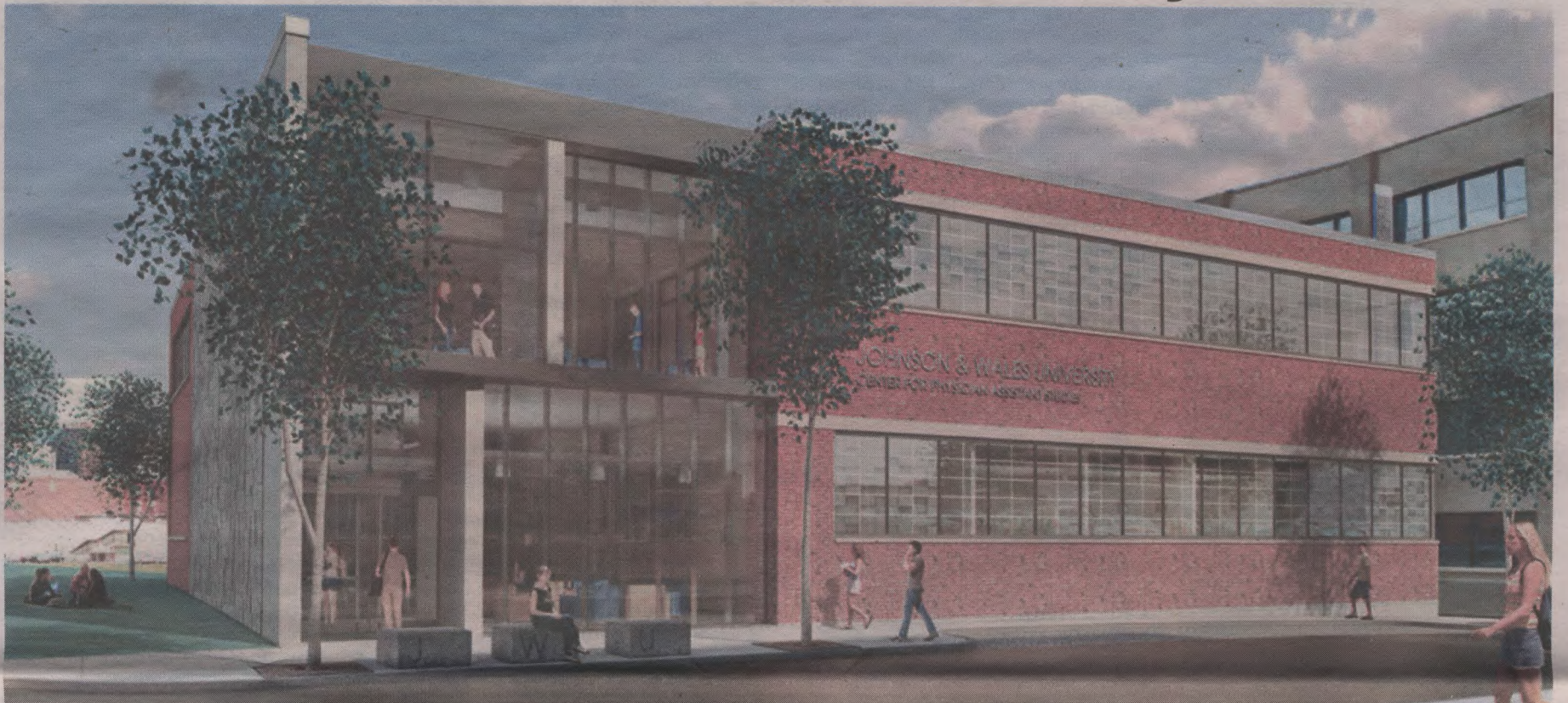
Johnson & Wales University's new center for Physician Assistant studies building, a digital creation.