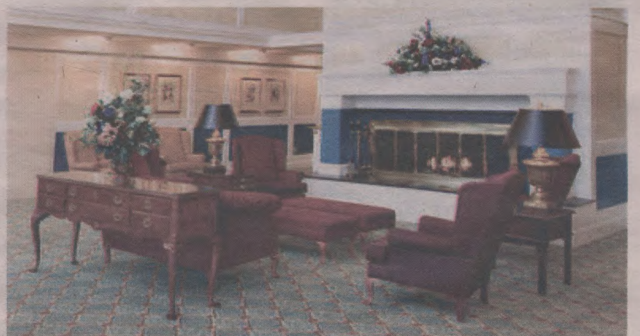
The Beautiful J&W Inn.

For over 30 years, the Johnson & Wales Inn has given many students the opportunity of a great internship experience, as well as job opportunities for student employee staff. The experiential education in the University's strategic plans, FOCUS 2011, and now 2017: The Centennial Plan, the University offers 1,700 internship sites in 49 states, providing more than 4,000 internship positions. Due to the growth in