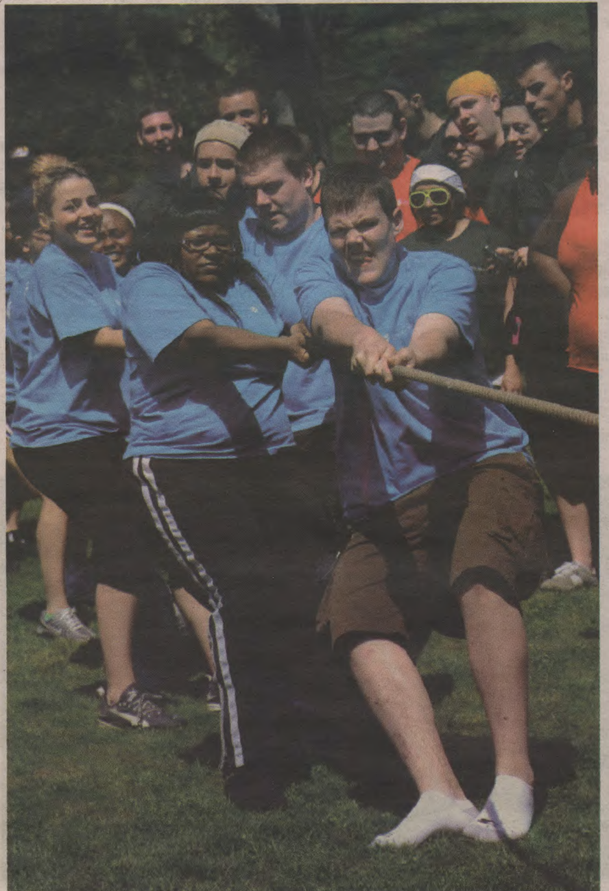
Students battle it out during tug-of-war at Battle of the Campus.

The staff team appropriately named "The Chosen" won this year's gold, taking the first place spot. A tie for second place was between "Chefs R Us" representing West Hall, and "Inferno" from Imperial Hall. In the Art Wars, "Ima Letchu Finish" from The Cove took first place. Congratulations to all the winners!