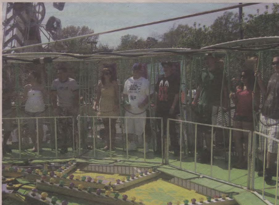
Students anticipate the start of a ride.