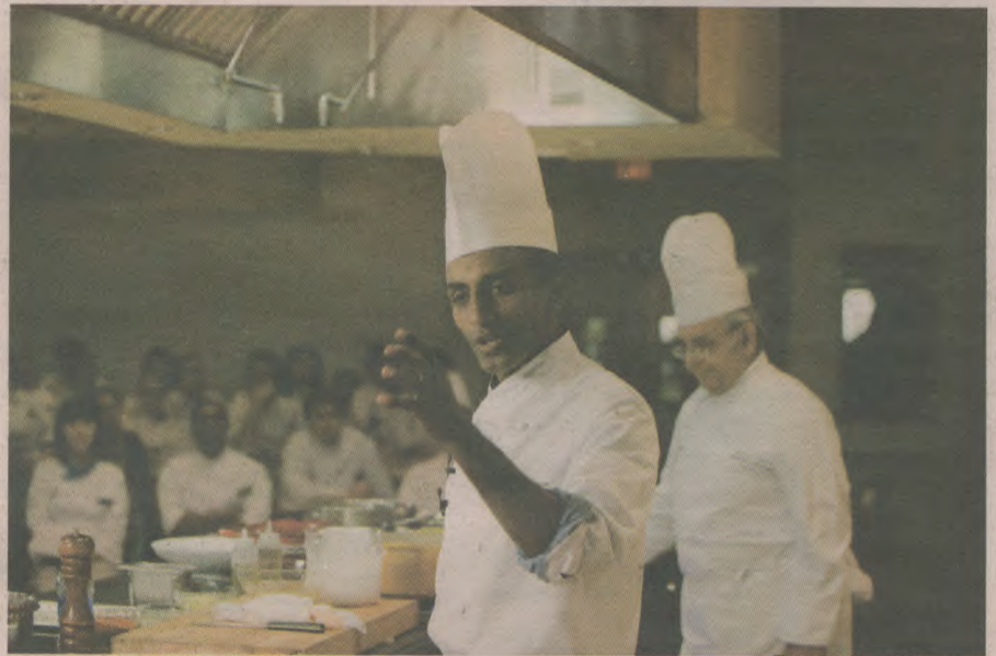
Demonstration CH Photographer

Chef Samuelsson received a James Beard Foundation Award for "Rising Star Chef" in 1999, and "Best Chef, New York" in 2003. He was also named as one of "The Great Chefs of America" by the Culinary Institute of America. Samuelsson also holds an honorary degree from Johnson & Wales University as a Doctor of Culinary Arts.