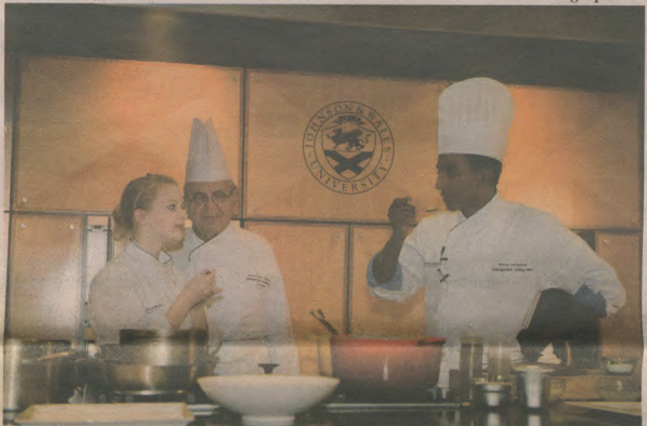
Demonstration CH Photographer