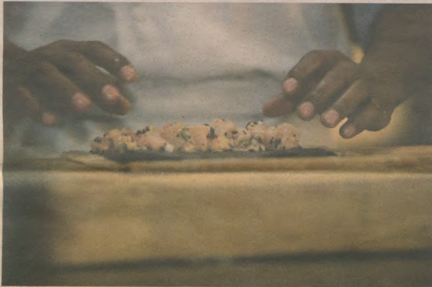
Food Prep CH Photographer