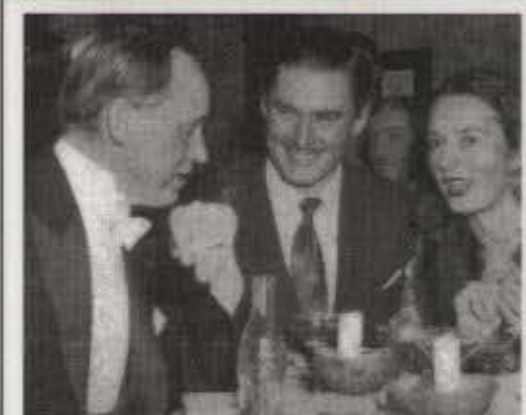
Opening Nite Errol Flynn danced nude on the bar