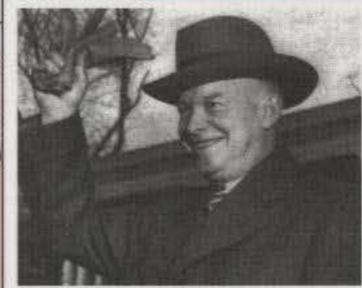
He always loved the Thunder Humpers

MADE IN AMERICA (FOUGHT AND DIED FOR) APPLE PIE $2.49 A LA MODE $2.99