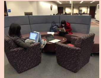
Work by yourself