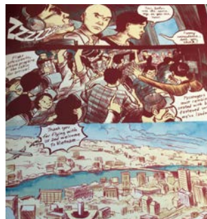
A page from Vietnamerica: A Family's Journey by GB Tran

Yet it is also true that graphic literature is now being taken more seriously as a literary genre, recognized as a powerfully expressive medium through which counterculture ideas can be popularized, and offering far greater representation of diverse, multicultural narratives than are found in traditional text-only literature.