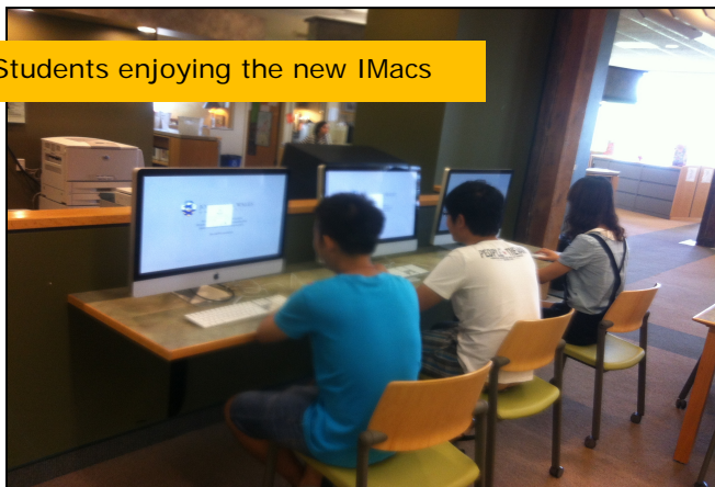
Students enjoying the new iMacs

As always, library computers are available on a “first come, first served” basis. Students are relied upon to model good citizenship by using the computers primarily for school work, especially during exam periods when demand for library computers is heaviest.