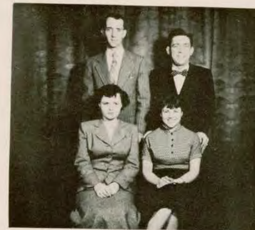
JUNIOR CLASS OFFICERS