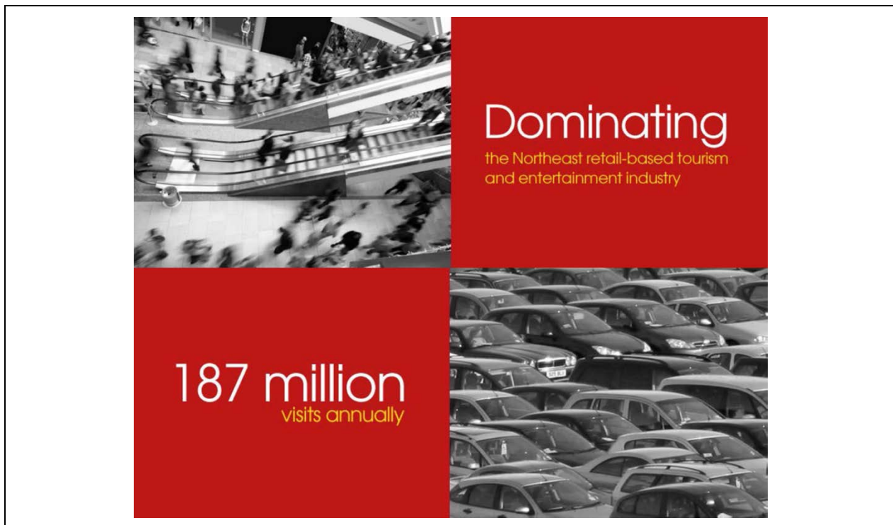
Figure 2. Pyramid Companies: Domination through Volume. 25

than 90 percent of those surveyed approved of the choice of location for the newly constructed interchanges, and just as many considered it “desirable” for “the local government to take part in decisions affecting that growth and development” sparked by these new transportation corridors. But respondents balked when it came to advocating direct “government control.” For example, when respondents were asked if they supported a statement indicating that land use should be determined by the individual property owner, rather than zoned as commercial, industrial, or residential, a startling 44 percent agreed. And when asked whether they had ever “publicly voiced an opinion either for or against planning in their respective communities,” only 36 percent had done so. At a time when the Interstate Highway System appealed to many as a way of linking communities through national infrastructure, these studies confirmed that local officials saw proximity to highway interchanges as critical to economic growth. And, yet, local