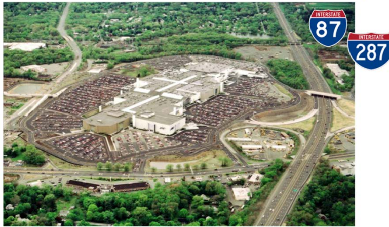
Figure 3. Palisades Center Mall, with direct access to I-87/287, the New York State Thruway. 36