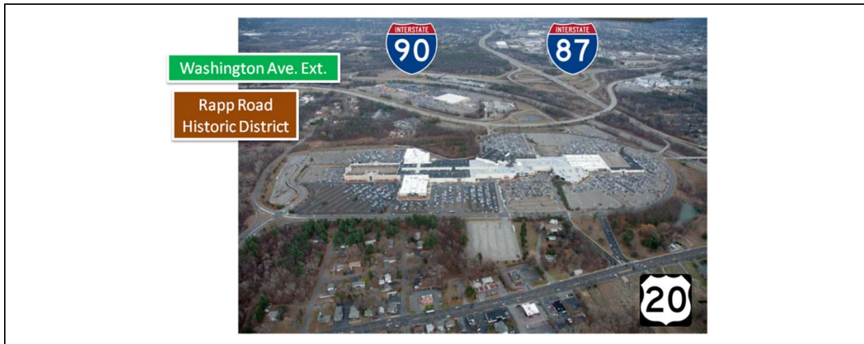
Figure 1. Crossgates Mall. I-90 (topmost arc); Washington Avenue Extension (U-shaped Expressway, above); I-87 (right); U.S. Route 20 (below). Note: The Rapp Road community is located between the mall and Washington Avenue Extension. 23