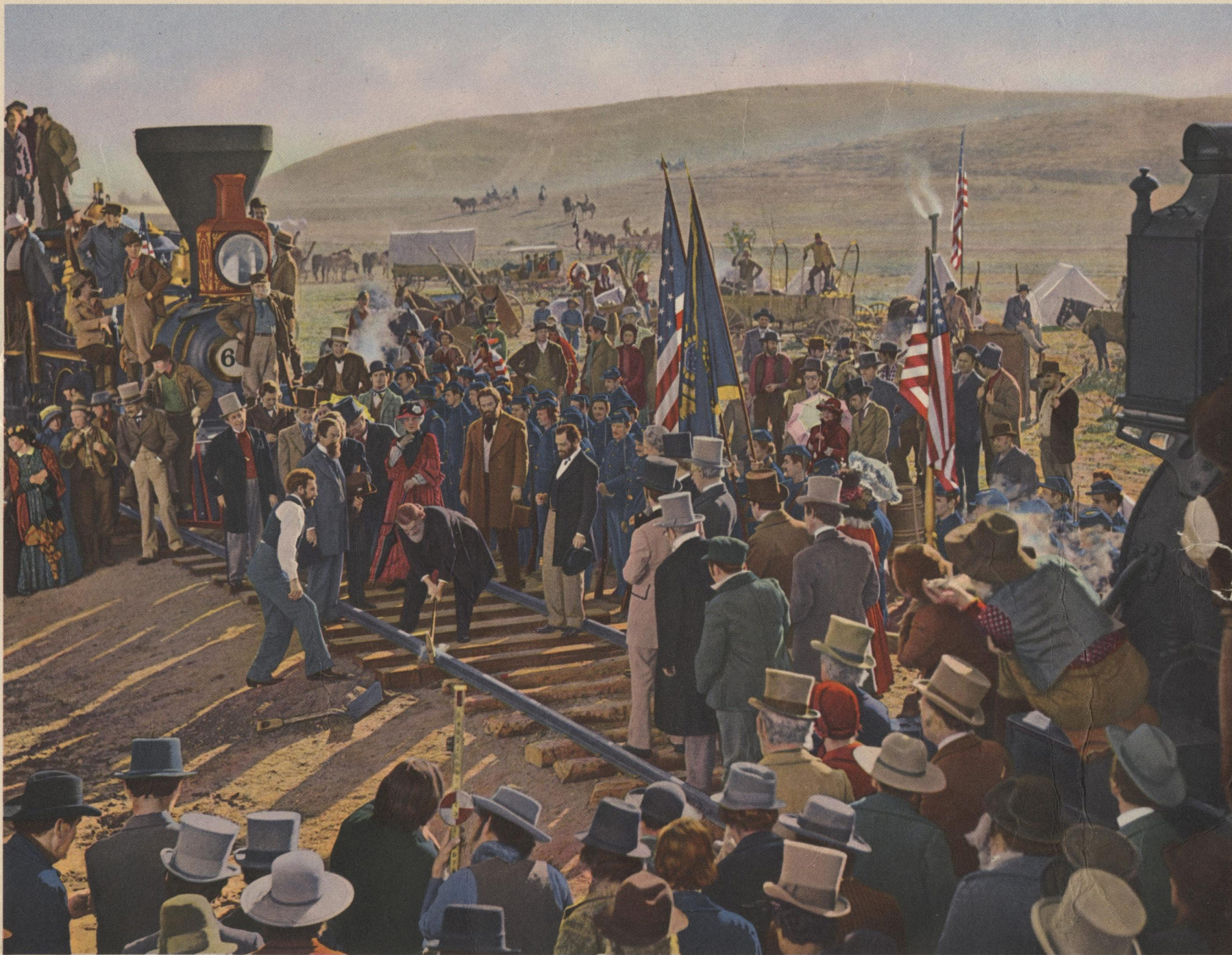
THE DRIVING OF THE GOLDEN SPIKE MAY 10, 1869, COMPLETED THE RAILROAD THAT HELPED TO UNIFY AMERICA.