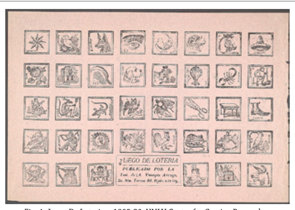
Fig. 4. Juego De Loteria c. 1905-20, UNLV Center for Gaming Research collection.

One exceptional example of early lottery art is