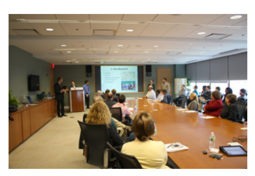
Fig. 7. Student research team presenting game prototype to GTECH staff.

One student team prototyped a thrilling post-modern twist on the GeoSweeps game. Called "HideOut" it featured an animated Zombie invasion (Figure 8). The winning strategy was to keep your coordinates undiscovered or essentially hide from the Zombies. In a sort of "last man standing" theme, players watched in horror as Zombies consumed their map. Players squirmed in agony hoping that the randomly marching Zombies would leave their coordinates alone. A good visual metaphor and animation provided drama, fun and a decent wager-based game.