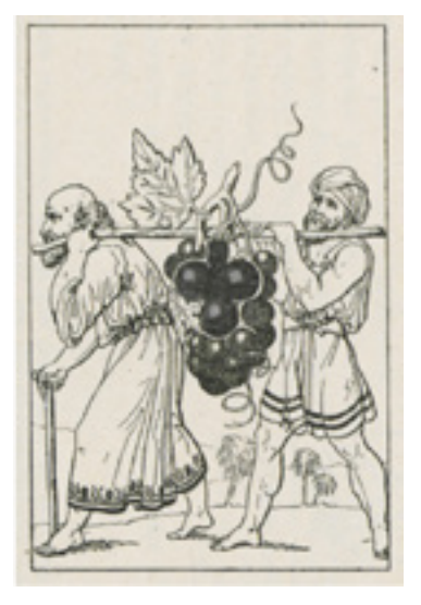
Fig. 2. Grape motif playing card, French, date unknown. Source: D'Allemagne, H. R. (1906). Les Carte a Joure.

The visual narrative of the playing card is a rich and diverse history. Considering the range of visual storytelling in French playing cards it is easy to imagine that while providing a function to play a game of chance, the playing card was also a visual platform for social parody and commentary, sublime artistic style. There is an element of irreverent delight and satire in a set that combines the mayor's family with the village pauper and the peasant farm girl cousin from the provinces. Some visuals entertain and titillate showing undergarments, glances of woman's bare skin, and young children using pottery to perform their toilet. One set portrays Moliere's comedic opera Monsieur de Pourceaugnac including the dance of ene-