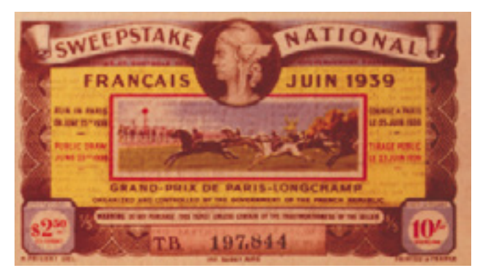
Fig. 5. 1939 Race sweepstakes presents pictorial modernism with a touch of art deco.

The French ticket illustrates bright tables that are adorned with sunflowers. Nurses are attending the children in careful detail. In a background frame a cow is being milked and cans of milk wait to be transported. This ticket is a story of care and nurturing for orphan children told through positive imagery, color and composition. The subjects of the theme are irresistible. Who could refuse purchasing a lottery ticket to support this vision of care for the less fortunate? Given the 1942 date of the lottery it is ironically optimistic in a dark period of French history. Perhaps it was the visual portrayal of abundance for orphans that lifted the spirits of the population.