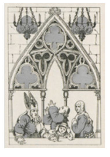
Fig. 3. Same deck, the grape motif is appropriated in the stained glass window. Source: D'Allemagne, H. R. (1906). Les Carte a Joure.

mas. Some were just joyfully entertaining, providing a glimpse of people at play on stilts. Others express a certain global awareness in accurate portrayals of indigenous people, flora and fauna from faraway exotic colonial outposts.