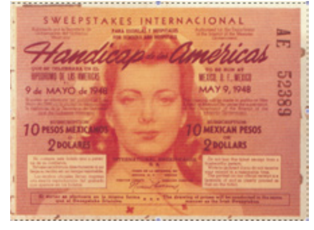
Fig. 6. Mexican schools and hospital lottery, 1948.