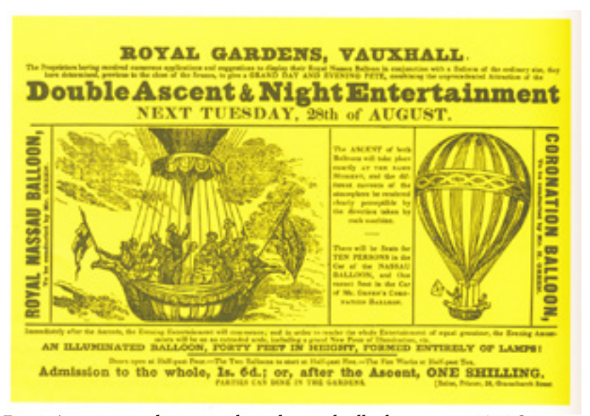
Fig. 1. Aeronautic adventure, the rich visual tells the story. c. 1851

In some sense, certain objects with paper artifacts among them, combine mythic power and symbols and create transformative experiences for the holder.