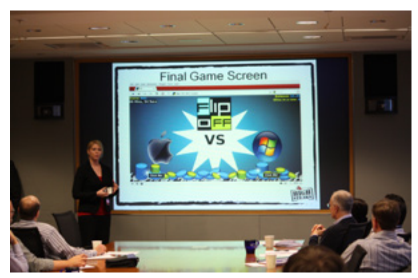
Fig 9. Student game designer presents a 'versus game' prototype – Apple or MS Windows?

When it comes to gaming, digital natives are indeed competitive. One constant feature that comes